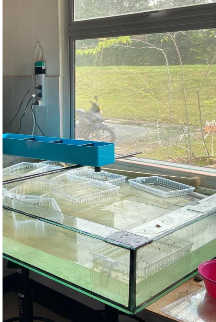
Figure 2. Experimental tank for observing the mating crabs.

Malaysia Bintulu, Sarawak (UPMKB), Malaysia. Under laboratory settings, the crabs were collectively housed in a glass aquarium measuring 2 m in width, 1 m in length, and 0.2 m in height, filled with filtered seawater (25 PSU). The aquarium was equipped with essential amenities including an overhead filter, protein skimmer, aerator, and ultraviolet sterilizer (Figure 2). The water conditions were maintained at ambient temperatures. A cohort of 22 inter-moult crabs, comprising 10 females and 12 males, with carapace widths ranging from 53 to 89 mm, were introduced into the tank on 23rd June 2022. Rectangular plastic baskets were provided as shelters within the tank. The rearing facility, situated indoors, allowed for natural light penetration through lightly tinted glass windows. The crabs were subjected to a daily feeding regimen consisting of squid and marine fish. Tank maintenance involved the siphoning of uneaten food and waste every two days, with water replenishment conducted accordingly. The absence of substrate facilitated unhindered observations and simplified cleaning procedures. Throughout the experimental trial, the crabs were afforded unrestricted mobility within the confines of their enclosure. Daily observations were conducted to detect any instances of pre or post-copulatory guarding behaviours.